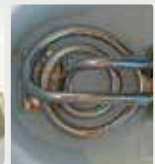
Inside a kettle