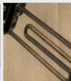
Heating element in a hot water tank