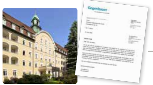
St. Joseph Hospital, Berlin