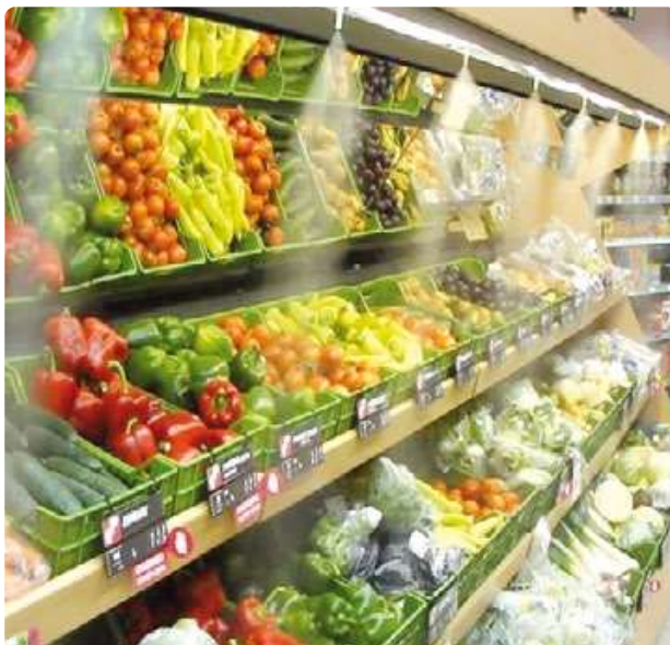
Misters in food section