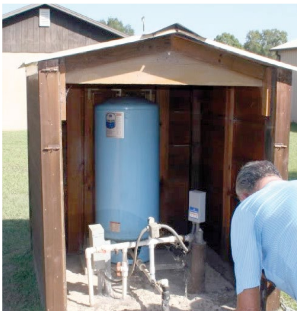
Home well water system