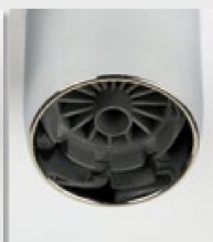
Nozzle of a faucet