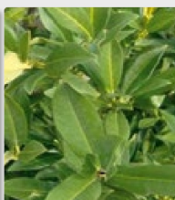
Plants and gardens