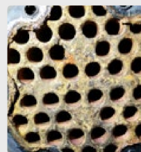
Shell and tube heat exchanger