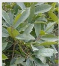
Plants and turf