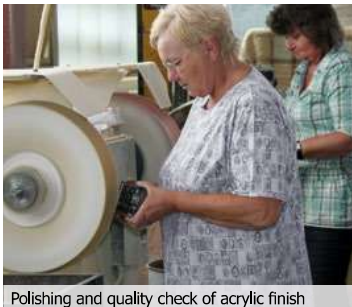
Polishing and quality check of acrylic finish