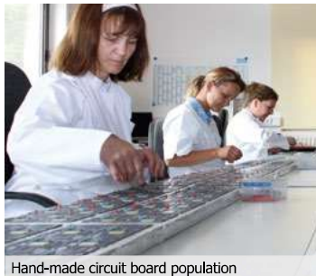
Hand-made circuit board population