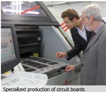
Specialized production of circuit boards