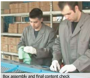
Box assembly and final content check