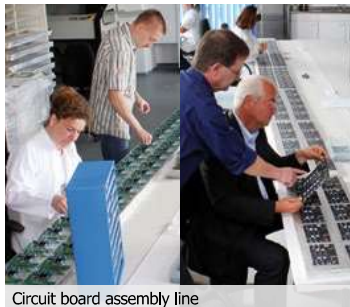
Circuit board assembly line