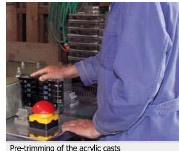
Pre-trimming of the acrylic casts